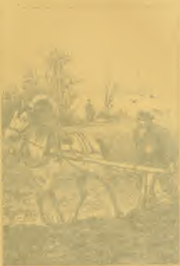
“But the candle was still burning.” A photograph from “The Life of a Soldier”