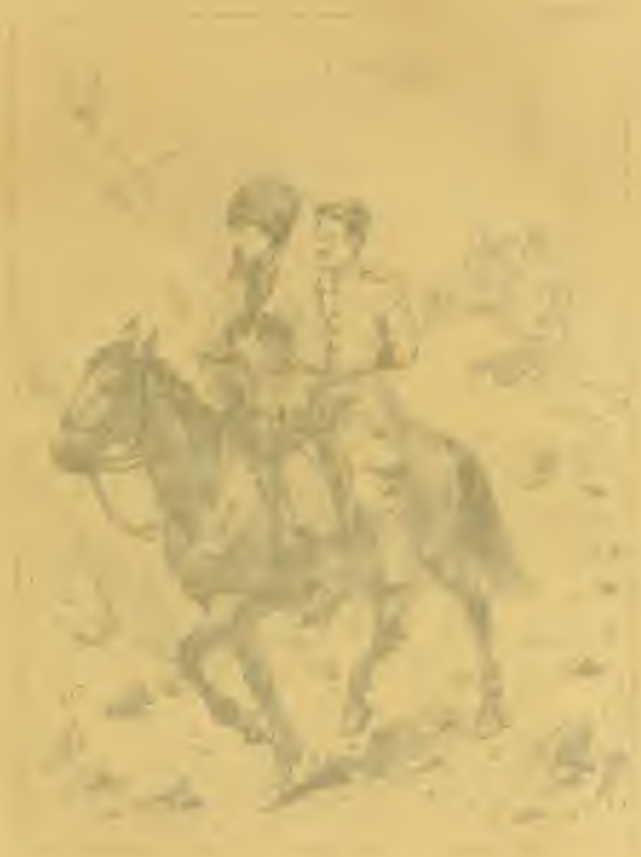
"They rode off to the mountains" Photograph from Journal of A. S. ...